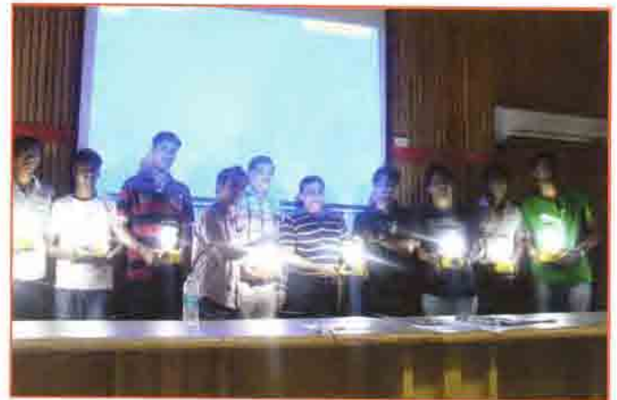
Rajiv Gandhi Akshya Urja Diwas on 20 th August, 2012 at MNIT, Jaipur.

Under Corporate Social Responsibility REIL has distributed Solar Lanterns to the winners of Quiz Competition organized on the occasion of