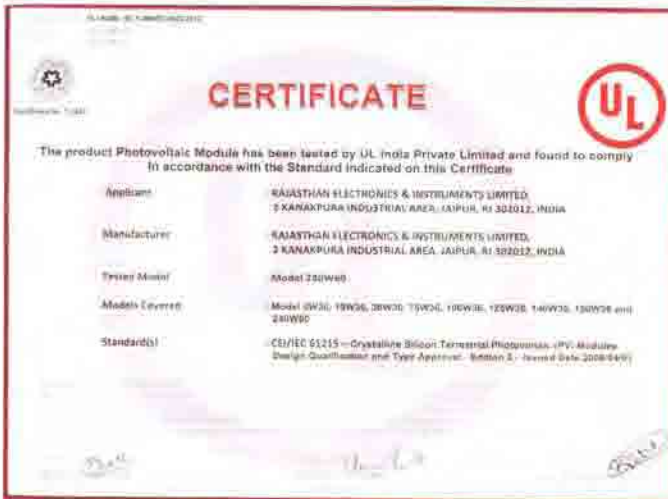
PV Module design Qualification and type approval Certification