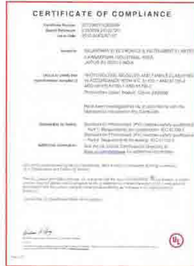
PV Module design Safety Qualification Certification

The Company has certification of compliance to International standards: CEI/IEC 61215 (Design Qualification) , IEC 61730-1 & 2 (Safety Qualification) and IEC 61701 (Salt Mist Corrosion testing) of Crystalline Silicon Terrestrial Photovoltaic (PV) Modules , popularly known as UL certification . This is the most prestigious quality standard.