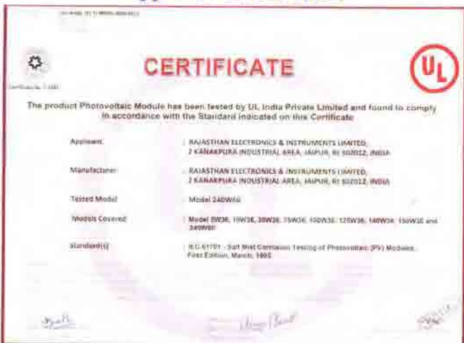
Salt Mist Corrosion Testing Certification of PV Modules